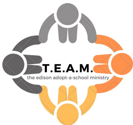
FIRST PRESBYTERIAN CHURCH - GAINESVILLE